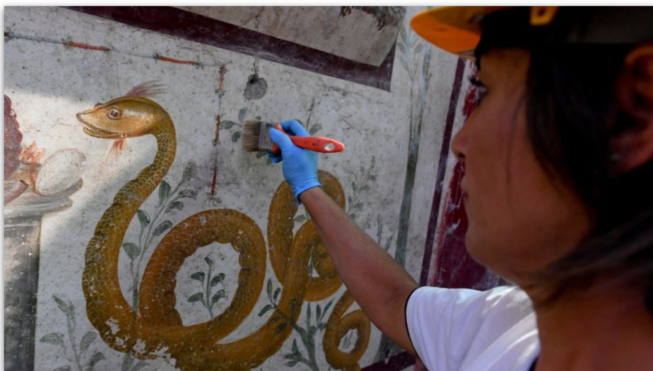
Pompeii's newly discovered Enchanted Garden room.